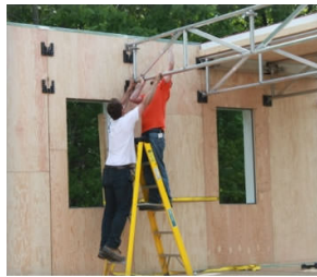
Versa Light Aluminum Truss Roof Support connected to I.S.P.